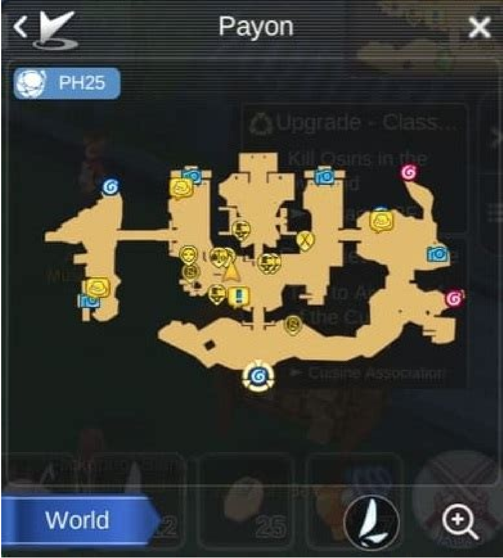
Minstrel ragnarok mobile.